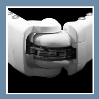
Premium built arms with stainless steel chain tension system, with stainless steel hardware and fasteners.