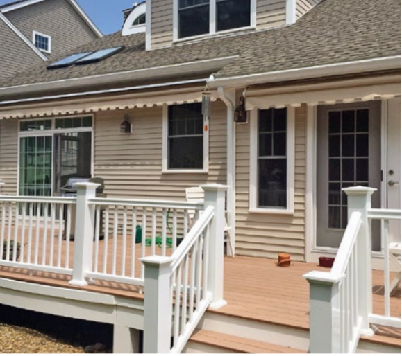
Series 8700 shown in OPEN position