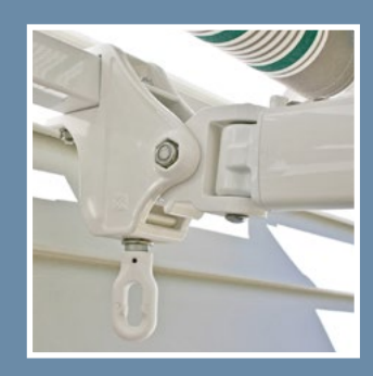
Flex-pitch shoulder gives control for projections up to 13'-2" through the use of a hand crank