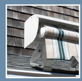
Installation options include roof mount brackets and WeatherGuard™ hood.