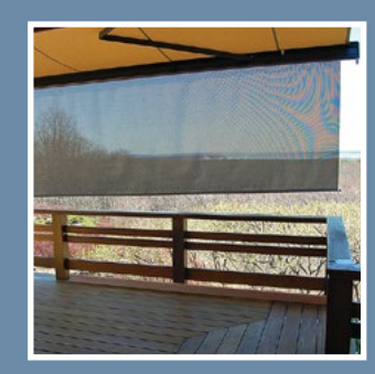
You may add a drop screen on awnings up to 11'-8" projection.