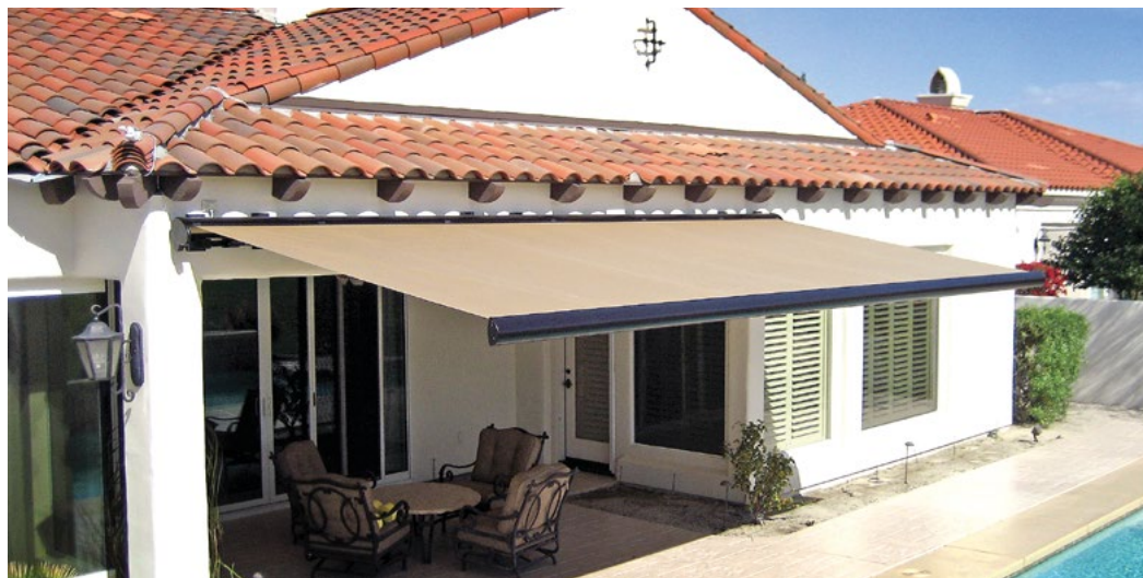
Series G250 shown in OPEN position